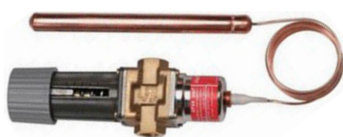
▲ Temperature Sensor

During installation the temperature sensor for the cooling valve will need to be installed in the correct location on the blowdown tank.