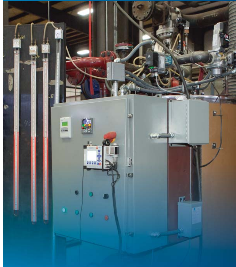
▲ All units are fully test-fired at the factory.